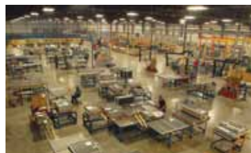
Facilities in Brownsville, TN