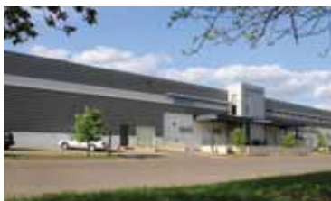
Headquarters, Minneapolis, MN